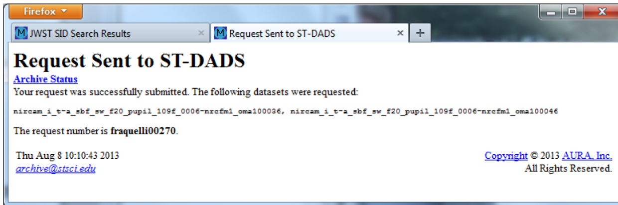
Figure 8: Request Accepted

The user will receive e-mail regarding the success or failure of the archive request. When data retrieval is complete, the user will receive an additional message giving the status of the retrieval. Figure 9 shows a typical message confirming receipt of the retrieval request, while Figure 10 shows the message for the retrieval response.